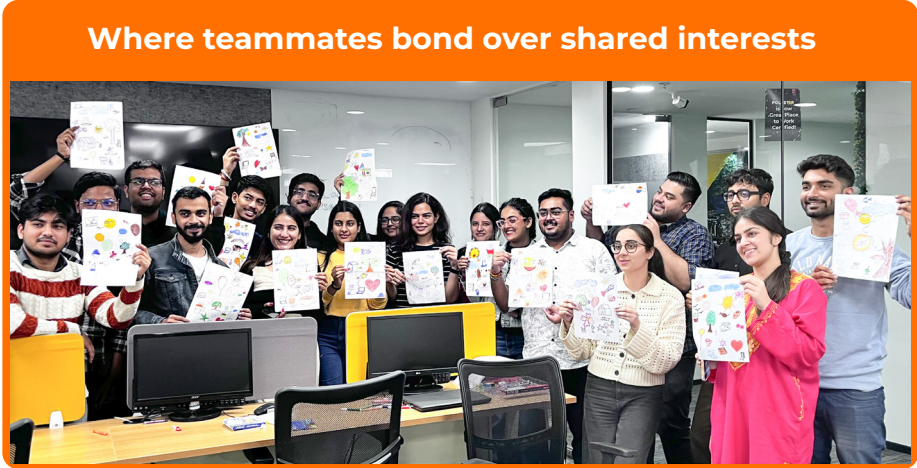
Where teammates bond over shared interests

In the Art & Craft Hobby Club , employees enjoyed a fun Skip & Paint session, creating perfectly imperfect artwork together.