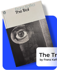
The Trial by Franz Kafka