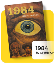
1984 by George Orwell