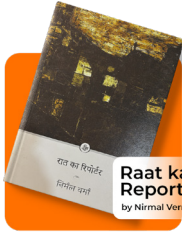
Raat ka Reporter by Nirmal Verma